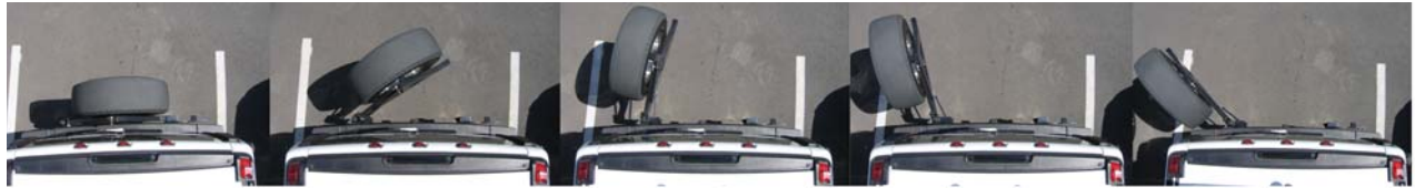
Optional Opening Assist Diagram

IMPORTANT: The carrier arm can not be lowered into the down position when the opening assist is attached. Please remove one side to lower into the dropped position.